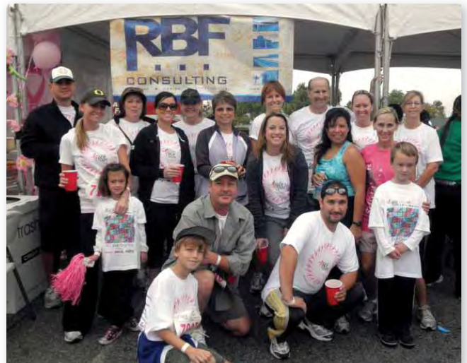
The RBF Race for the Cure Team.