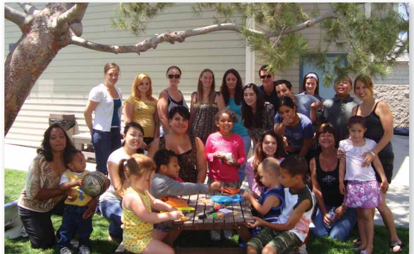
RBF volunteers with the Regina House residents.