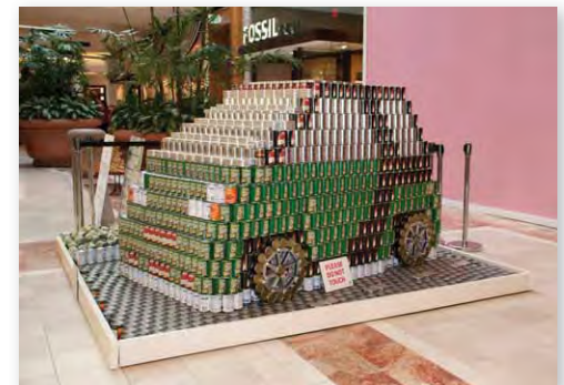
RBF's "Smart" car display at South Coast Plaza.

In September, the Irvine Office was proud to be one of 14 Orange County companies participating in the Orange County Canstruction® competition held at South Coast Plaza in Costa Mesa, California. The dedicated RBF Canstruction Team, combined with the efforts of the Good Works Committee, volunteered their time to design, collect the necessary materials, and build the structure. RBF's to-scale model of a "Smart" car was cleverly named "Be Smart, Drive Away Hunger" and represented RBF Consulting's Transportation practice area which focuses on Sustainability, Smart Growth and Smart Transportation Solutions/Smart Streets. RBF's "Smart" car won the "Best Meal" award with over 9,600 cans of food donated to the Orange County Food Bank. Thank you to everyone in the Irvine Office who contributed and a special thank you to the Canstruction Team for the countless hours they dedicated to this great cause.