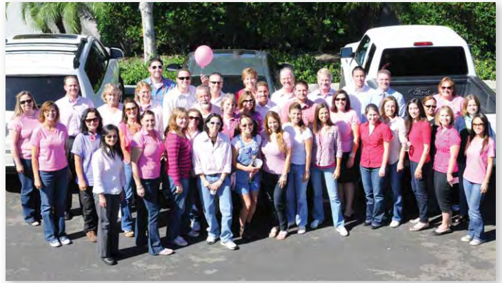
RBF Irvine Office team members wearing pink in support of Breast Cancer Awareness Week.

The Irvine Good Works Committee hosted its annual Pink Day in honor of Breast Cancer Awareness Month in October. Many RBF Irvine team members wore pink to work on October 28 in an effort to raise breast cancer awareness. As in past years, team members who wore pink in support of the cause gathered in the afternoon for some group photos. Thank you to everyone who wore pink to help raise breast cancer awareness.