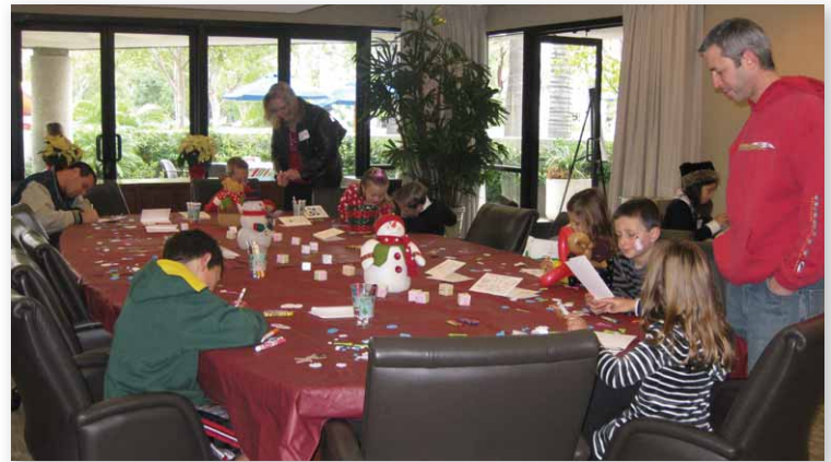
Team members and their family members busy decorating holiday cards.