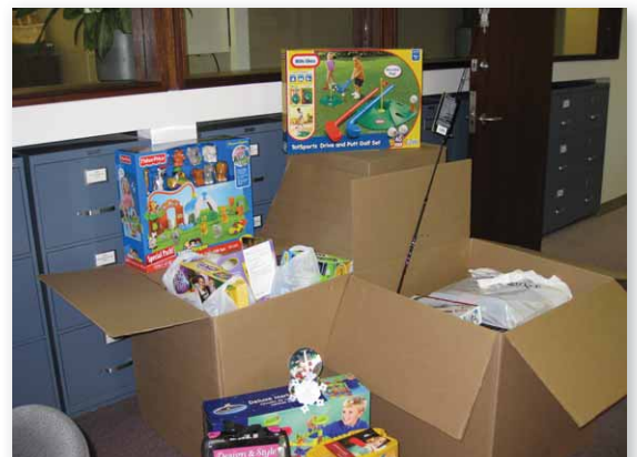
Holiday “wishes” ready to be delivered.