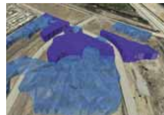
3D Visual Analysis